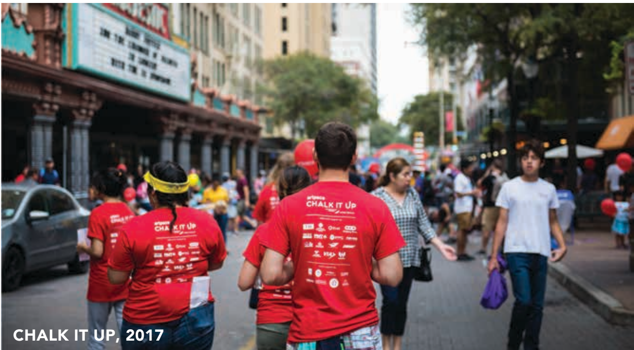
CHALK IT UP, 2017

In 2017, Chalk It Up was named "Best Downtown Event" at the 2017 Centropolitan Awards. This year's Chalk It Up features an exciting new footprint which extends along the freshly redesigned Main Avenue. All support received for this free, family event will ensure the sustainability of Artpace's public programs and the Artpace Teen Council. We hope you will join us as a sponsor during this once-a-year opportunity.